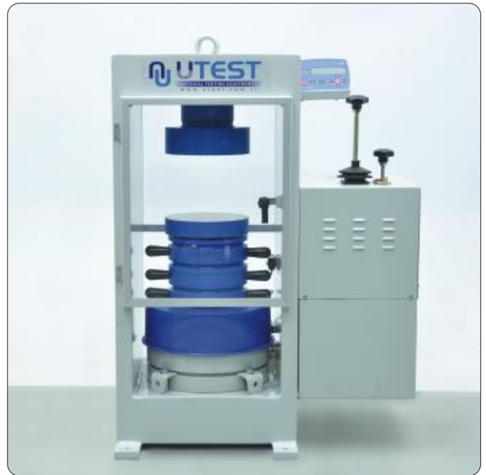
UTC - 4121

The UTEST Semi-Automatic (Motorized) range of 600 kN and 1500 kN capacity compression testing machines have been designed for reliable and consistent testing of a wide range of specimens. These compression testers are manufactured as a result of continuous applications and research studies to upgrade the machines with the latest technologies to conform to the current standards ASTM C39; AASHTO T22; ISO EN 7500 in terms of its technical properties taking into account the client requirements. These machines also meet the requirements of CE norms with respect to the operator's health and safety. Their user-friendly design enable an inexperienced operator to perform the tests.