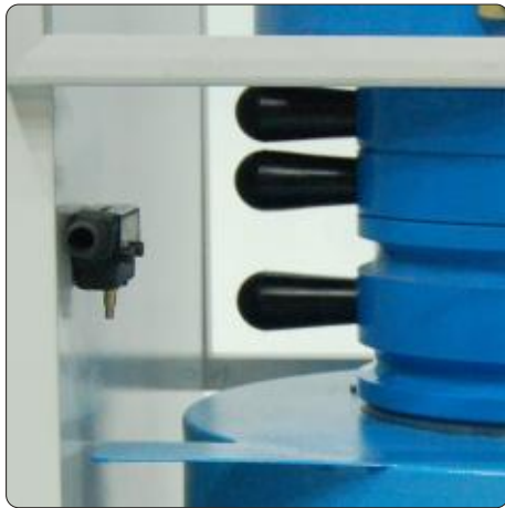
Loading Cylinder Assembly and Limit Switch

Big size distance pieces are equipped with handles.