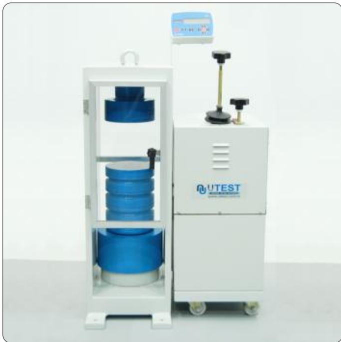
UTC - 4021