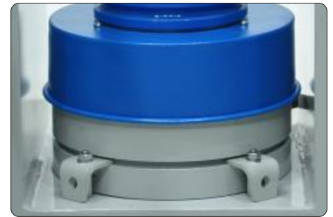
Loading Cylinder Assembly